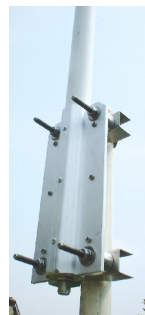
mast mount baseplate